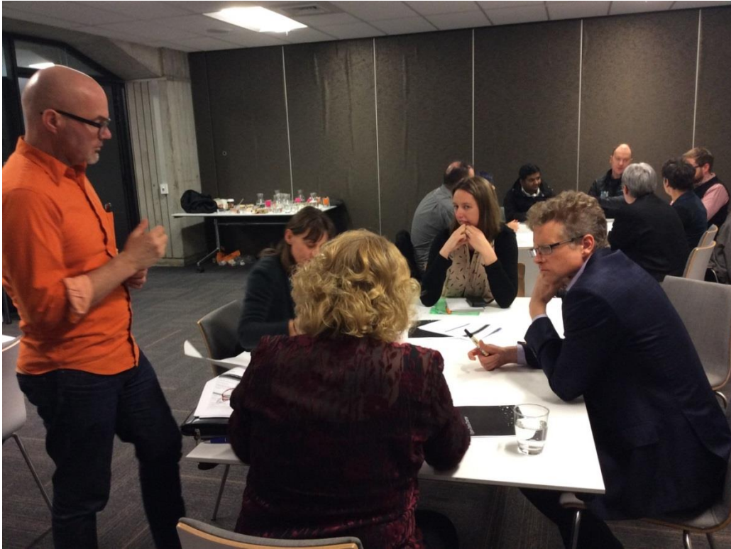
The Open Data Charter consultation workshop in Wellington

The Open Data Charter Public Consultation included a two-stage approach that ran throughout August and September 2016. The process was designed to give interested and potentially affected parties with the opportunity to provide their thoughts about whether New Zealand should adopt the Open Data Charter and the impacts if it is was to be adopted.