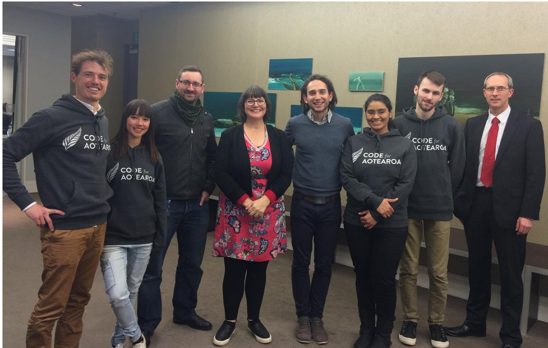
Members of Code for Aotearoa & Open Data NZ at the launch of the Fellowships

The Code for Aotearoa Open Data Fellowships operated in Wellington, New Zealand between 12 September and 2 December 2016. Land Information New Zealand/Open Data NZ provided pilot funding to Code for Australia to set up Code for Aotearoa in New Zealand, and pilot 3-month fellowships to test if the model could be adapted for the New Zealand environment.