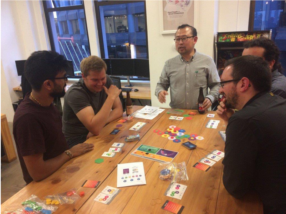
Playing Datopolis at DOT Loves Data

The UK's Open Data Institute released the open data board-game, Datopolis , in 2016 under an open source license. The board-game uses data to build tools and players work individually to complete their tools, but need to work collaboratively to win the game.